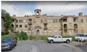
La Ventura Cincinnati, OH OHPTCP Award: $240,750