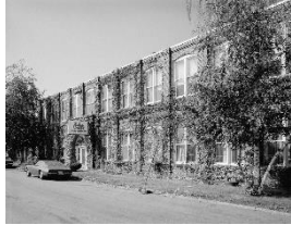
Rauch & Land Carriage Co. Apartments Cleveland, OH OHPTCP Award: $5,000,000