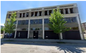
1301 Adams Street Toledo, OH OHPTCP Award: $1,140,764