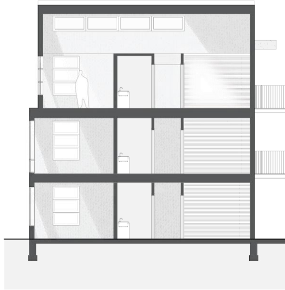
East-West Section Looking South