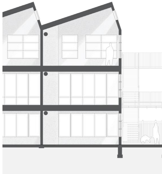
North-South Section Looking East