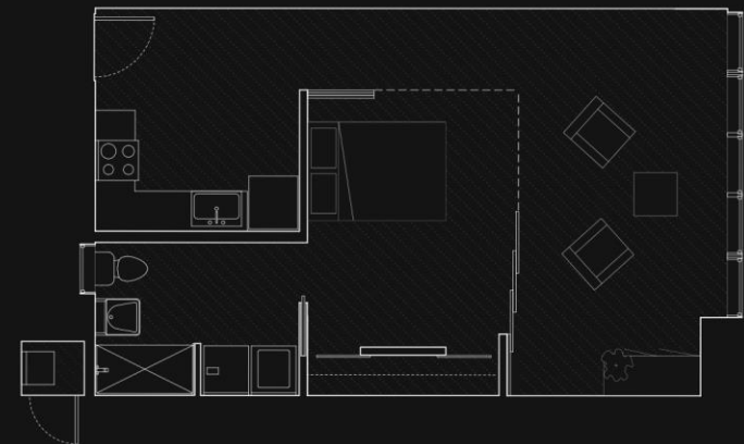
Unit Type B