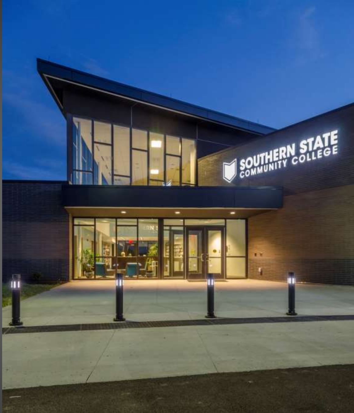
Brown County Campus - Southern State Community College | BHDP Architecture