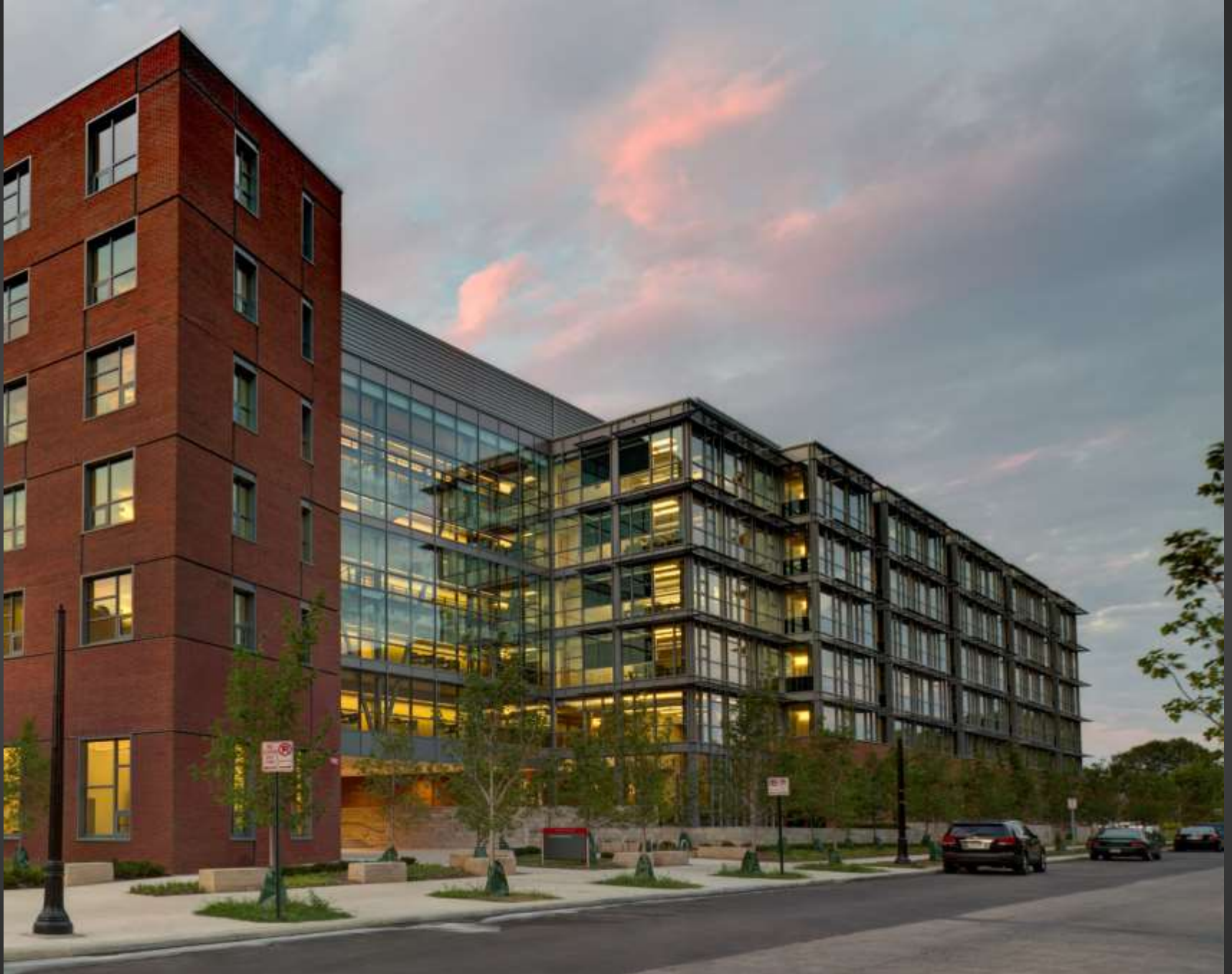
Residence on 10 th | Acock Associates Architects