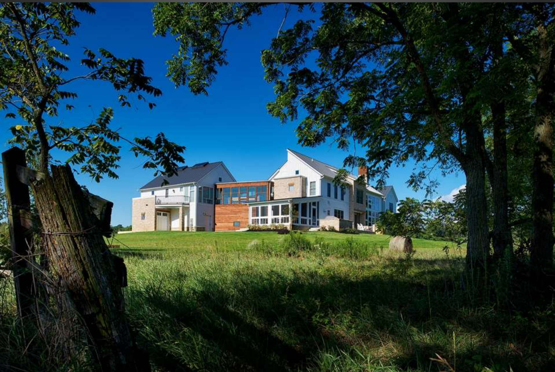
Private Residence | Meyers + Associates Architecture