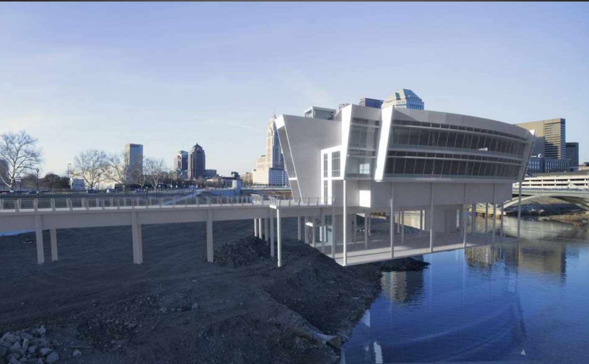
Hero USA Boathouse | Macrae ARCHitecture