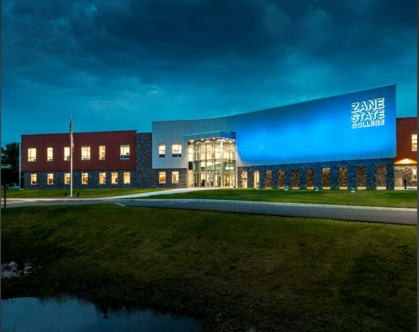
Zane State College Advanced Science & Technology Center