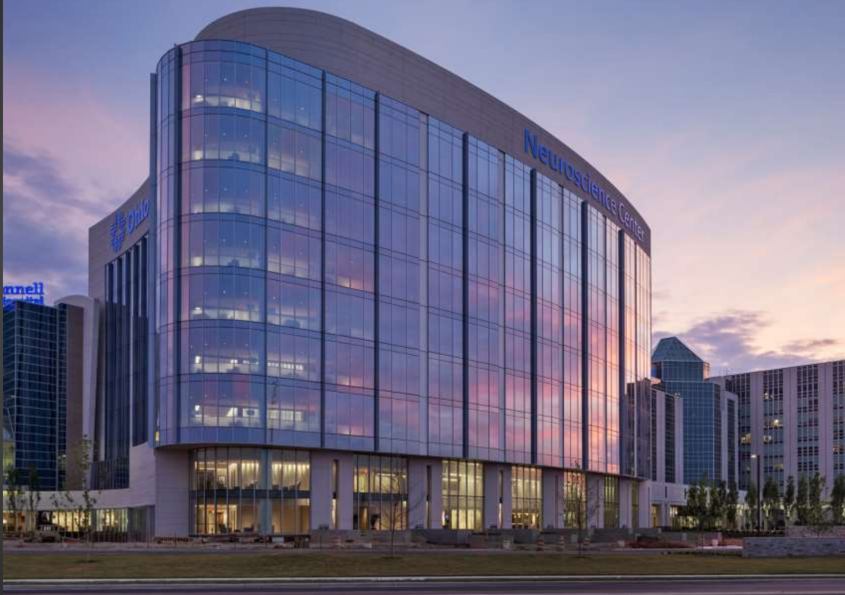
OhioHealth Neuroscience Center | NBBJ