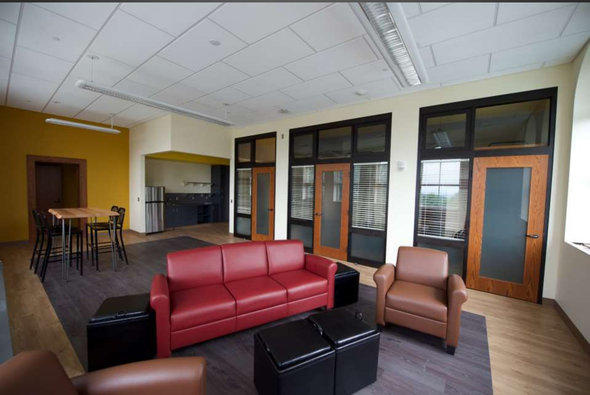
College of Wooster Gault Schoolhouse | BSHM Architects