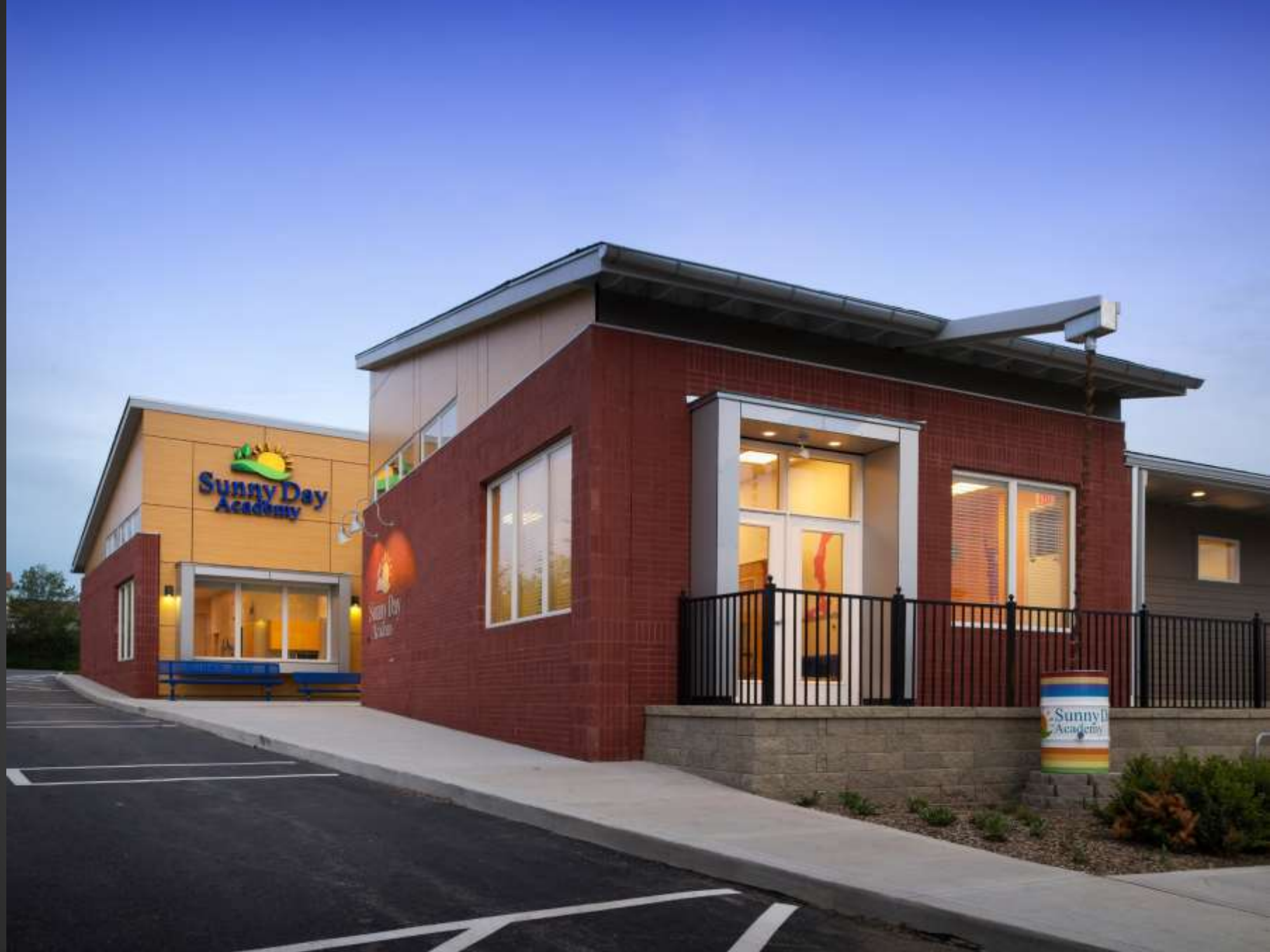
Sunny Day Academy | BBCO Design