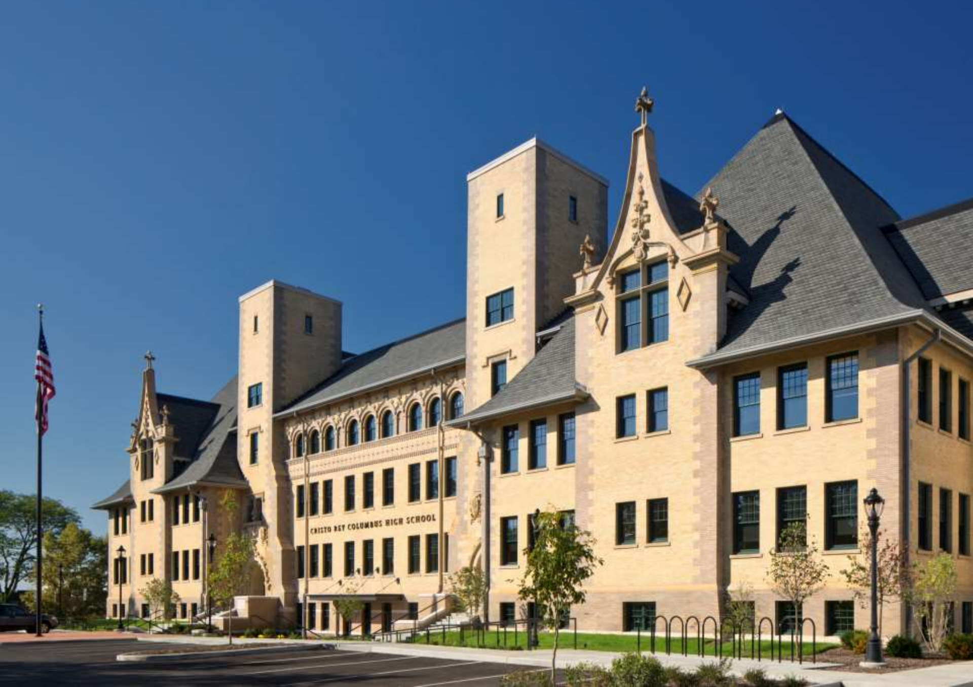
Cristo Rey Columbus High School | Schooley Caldwell Associates