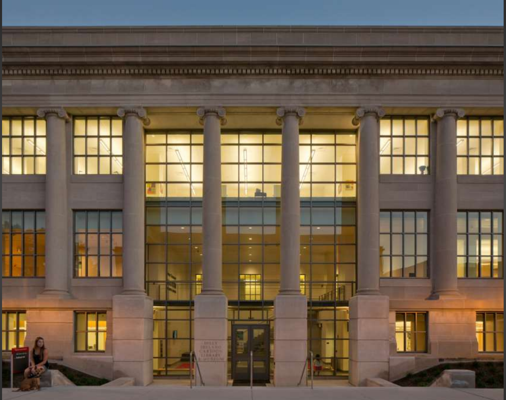
Sullivant Hall and Billy Ireland Cartoon Library & Museum | Acock Associates Architects