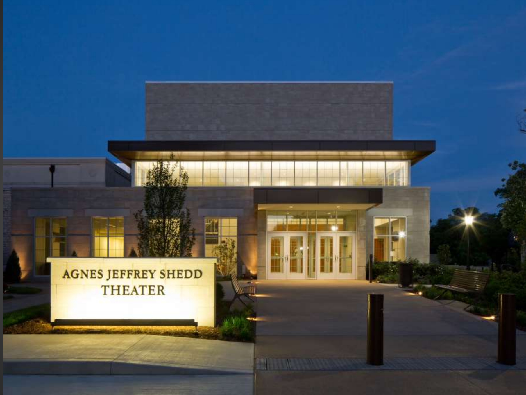
Columbus School for Girls Landmark Project | DesignGroup