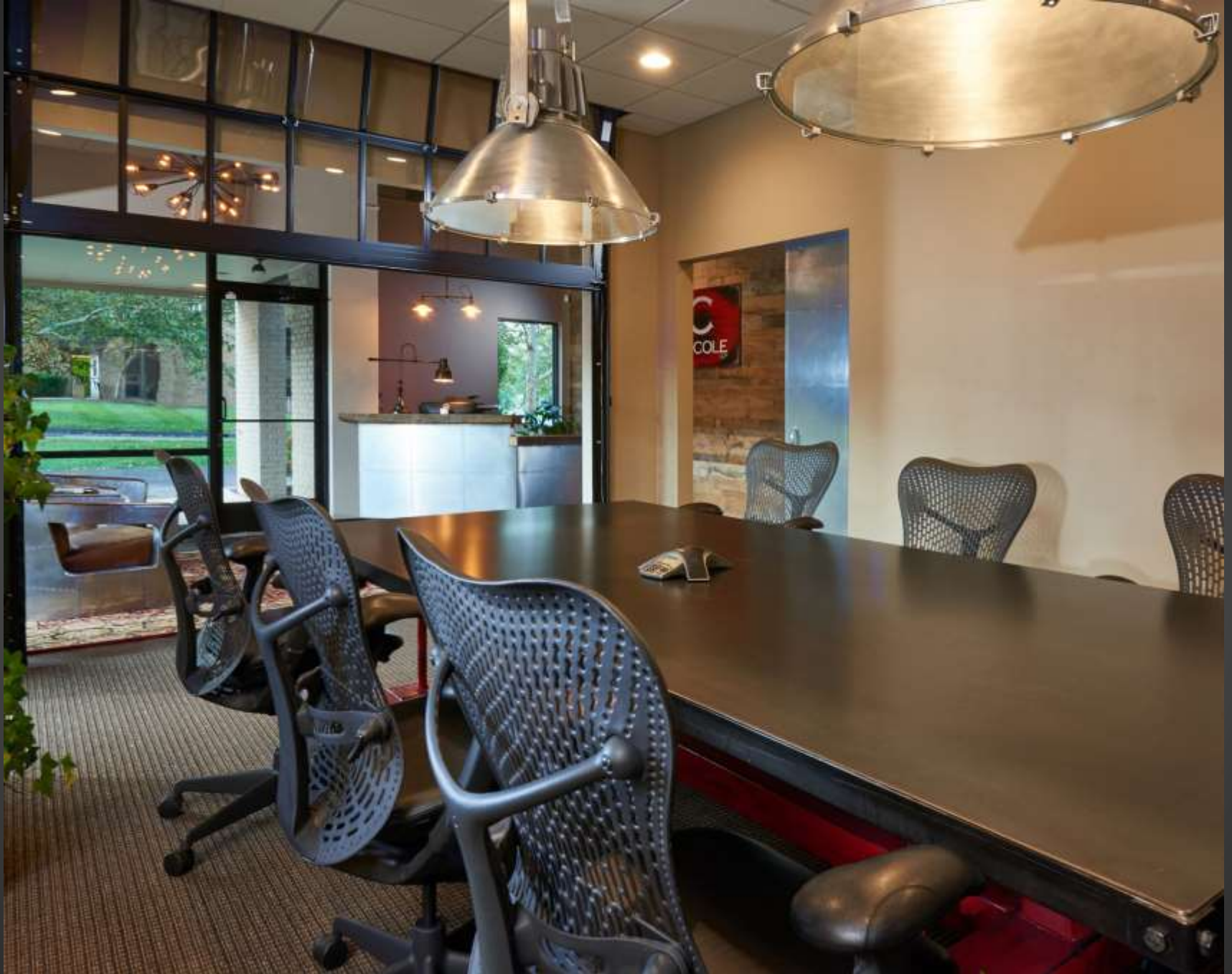
Organ Cole Law Office | Sullivan Bruck Architects