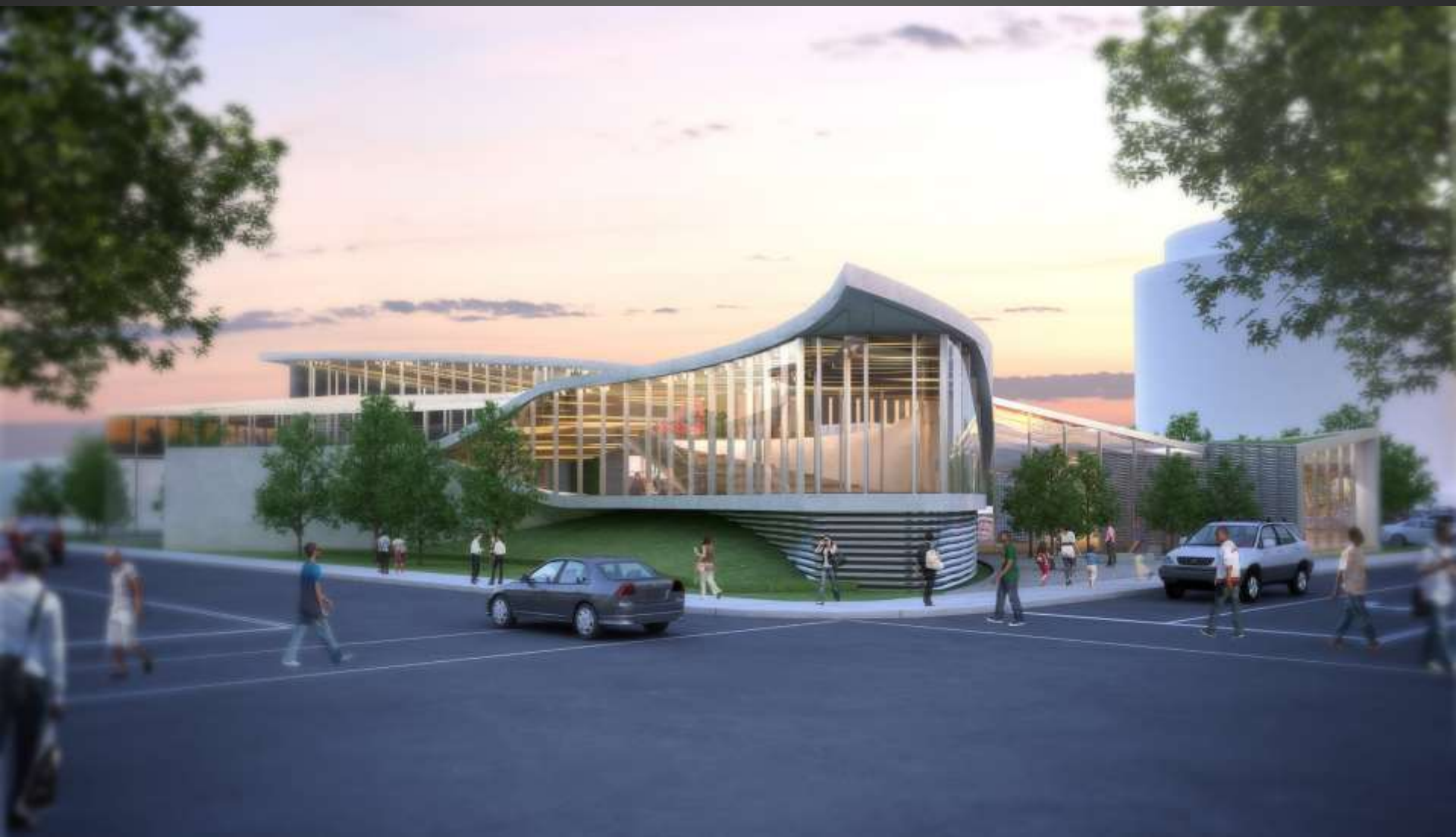
Columbus Metropolitan Library Martin Luther King Branch | Moody Nolan, Inc.