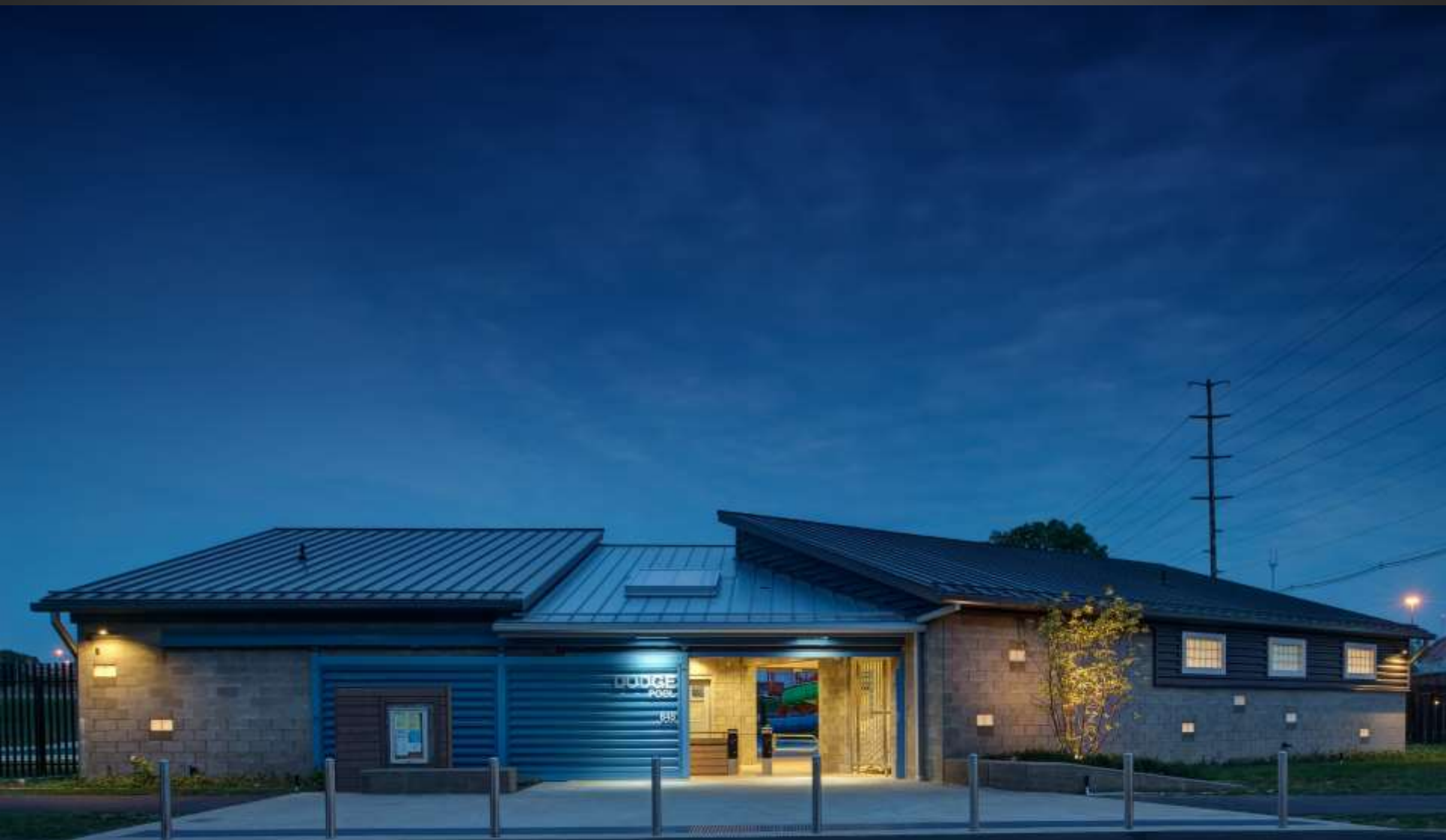
Urban Aquatics Center | Meyers + Associates Architecture