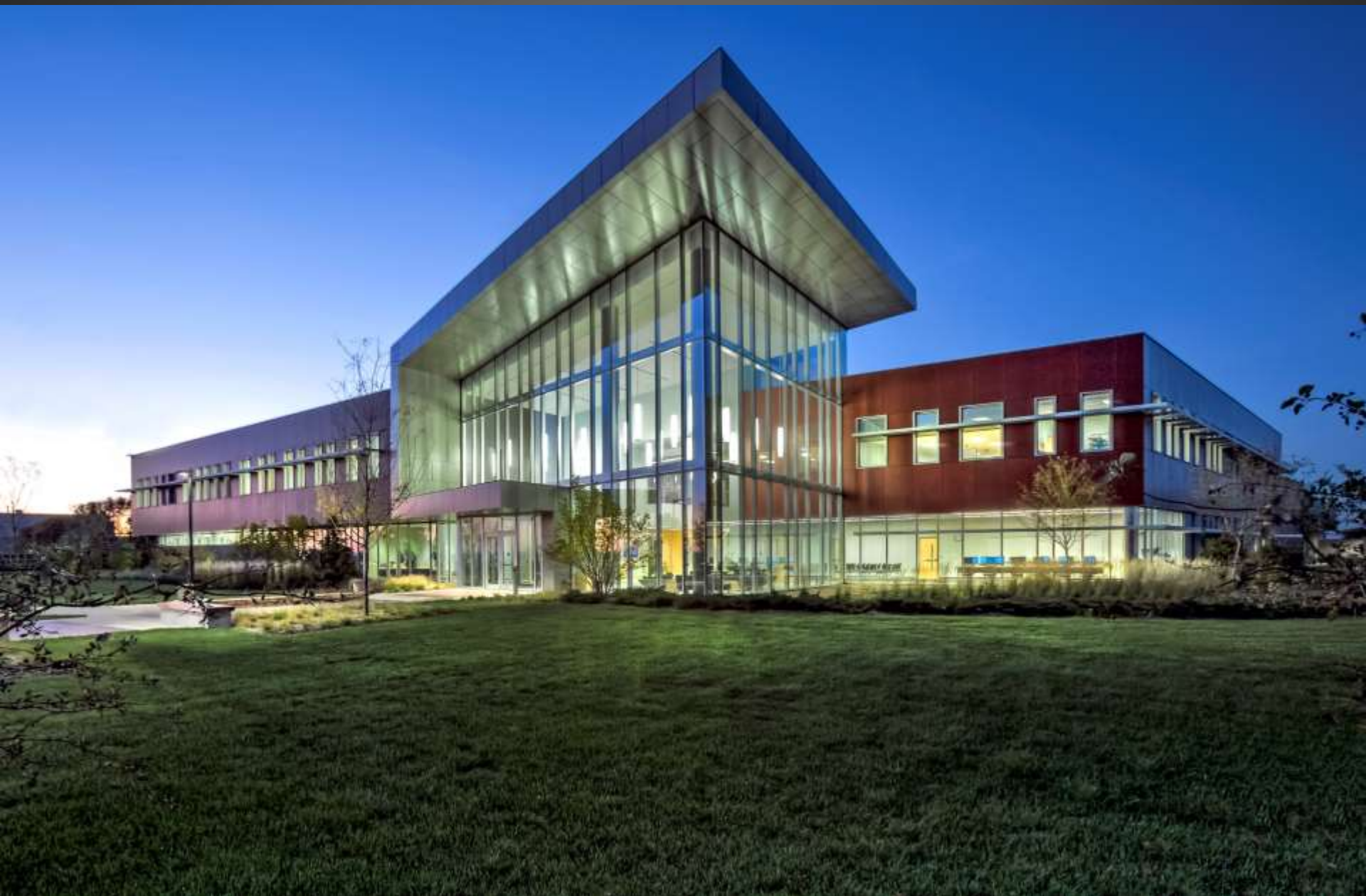
Kishwaukee College Student Life Center | Moody Nolan, Inc.