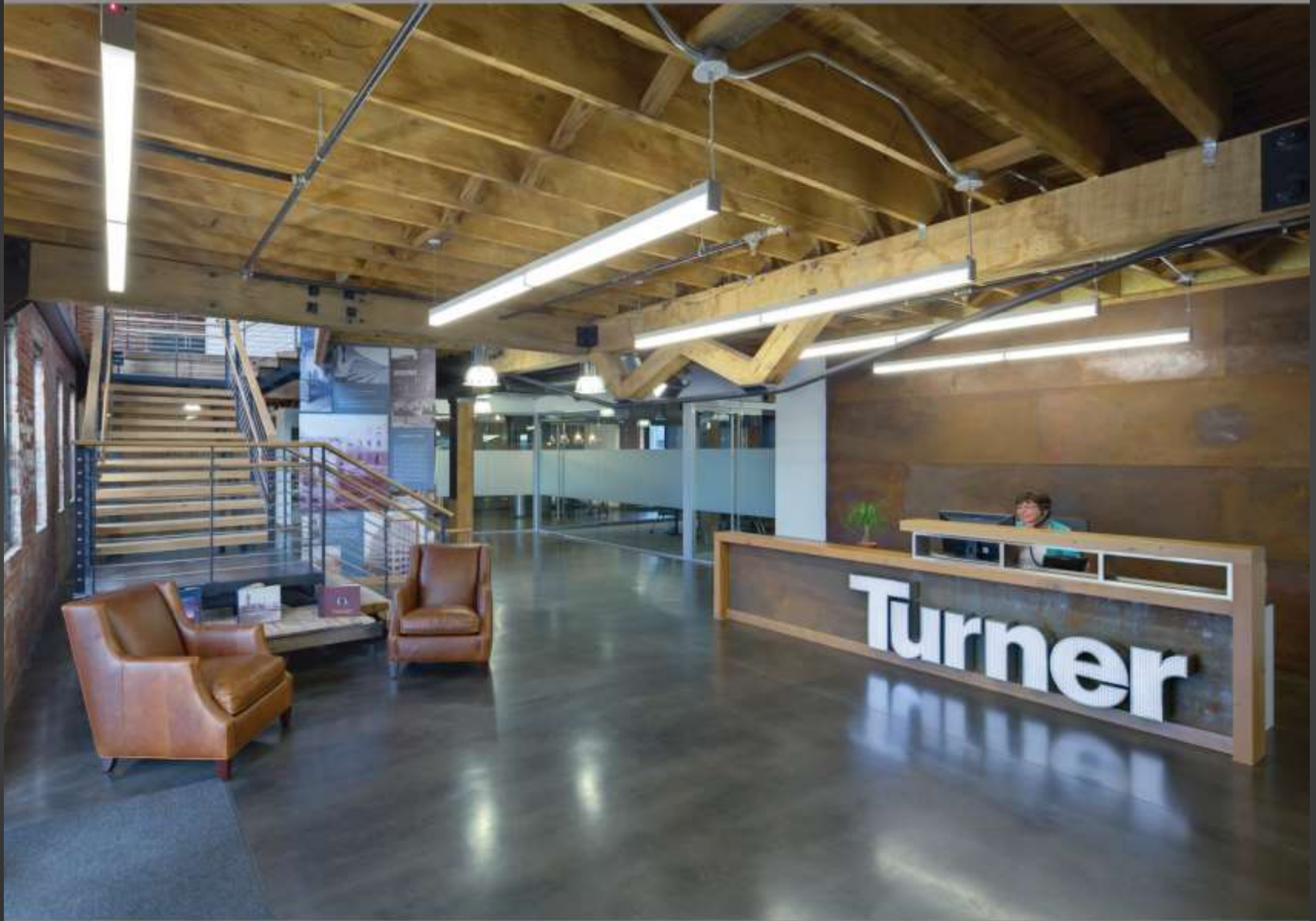
Turner Construction Columbus Headquarters | M+A Architects