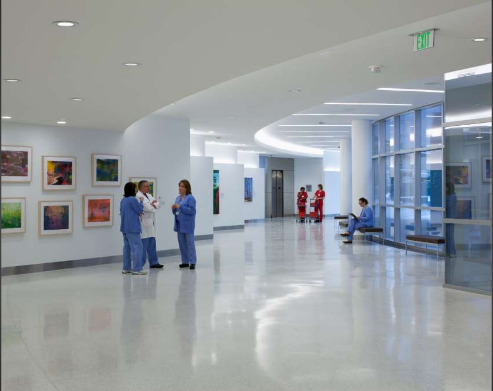
Cleveland Clinic/Fairview Hospital ED/ICU Interiors | DesignGroup