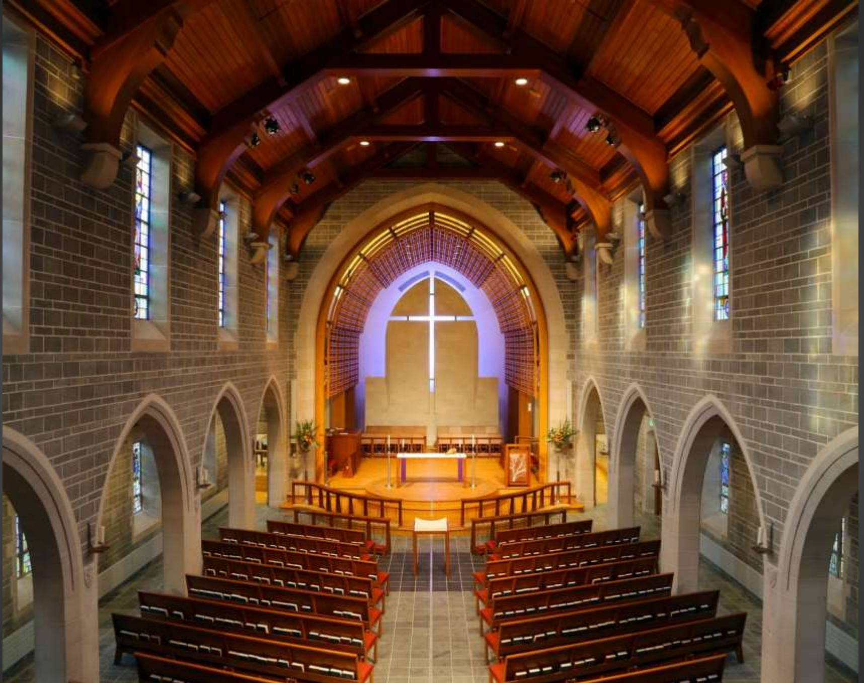
Episcopal Church of the Redeemer – Sanctuary Renovation | Phillip Markwood Architects, Inc.