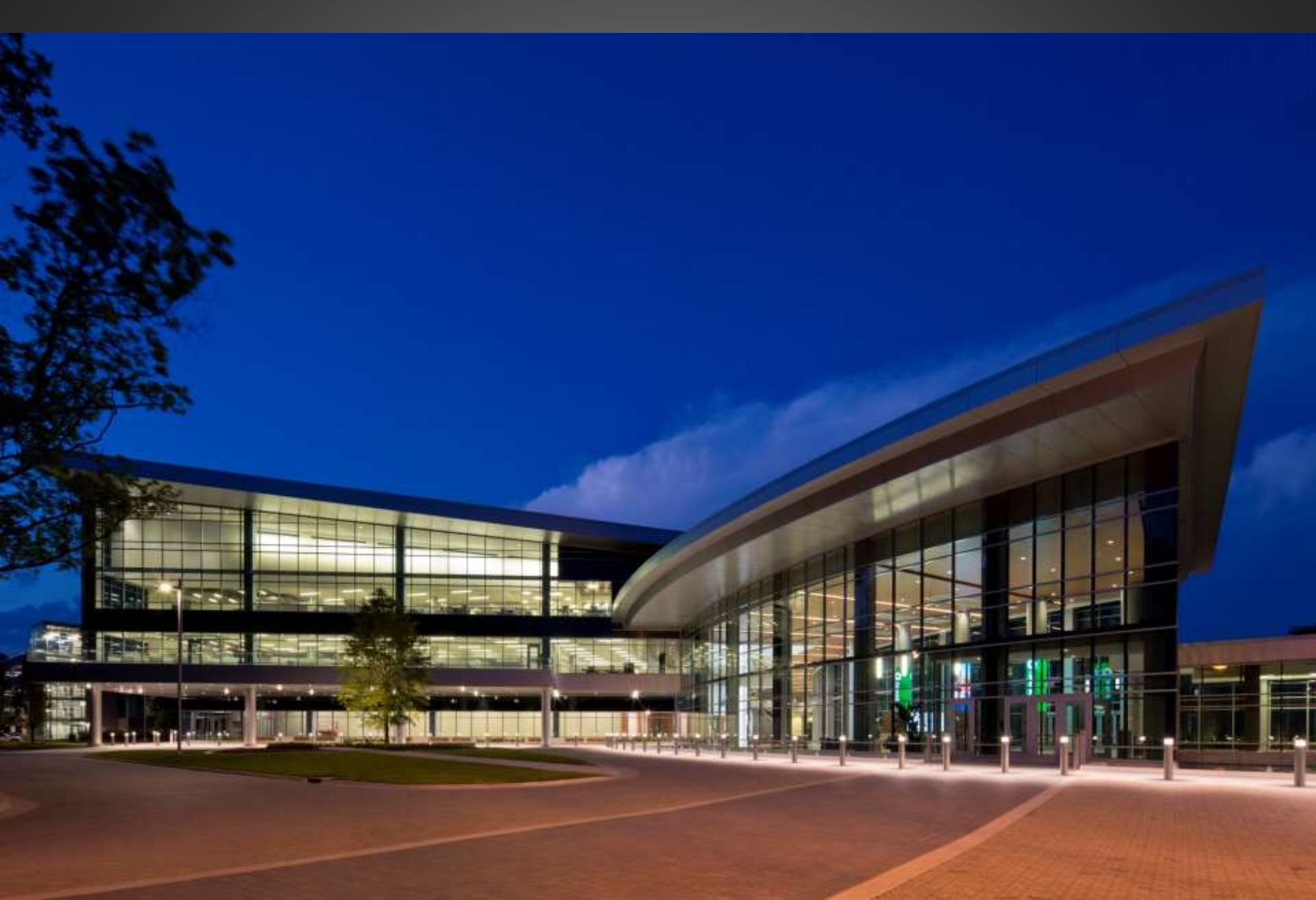
CenturyLink Technology Center of Excellence | Moody Nolan, Inc.