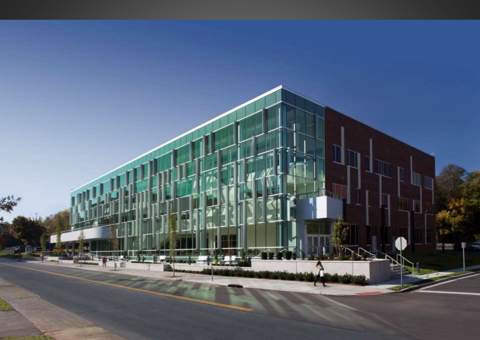
Meharry Medical College The Cal Turner Center for Student Education | Moody Nolan, Inc.