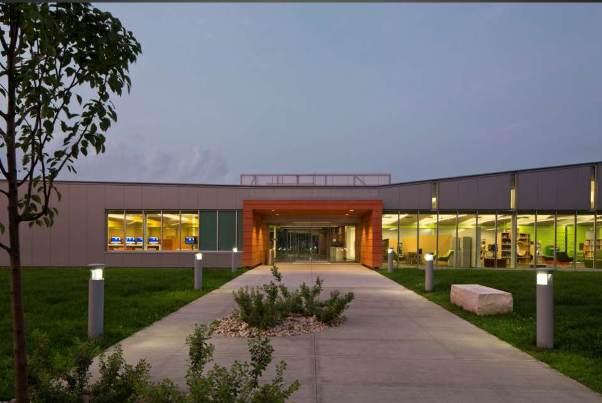
Columbus Metropolitan Library – Whitehall Branch | Jonathan Barnes Architecture and Design