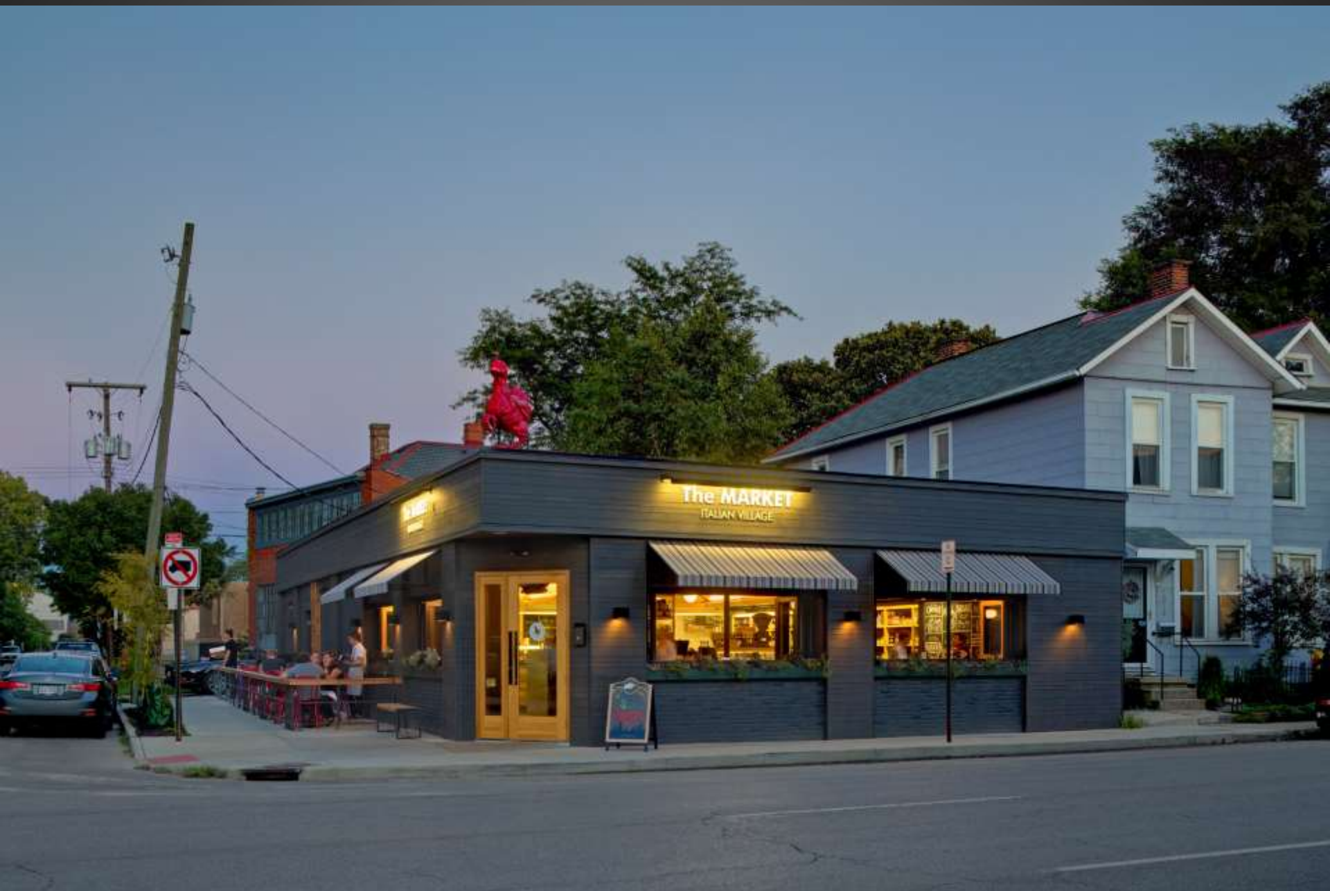
The Market Italian Village | Tim Lai Architect