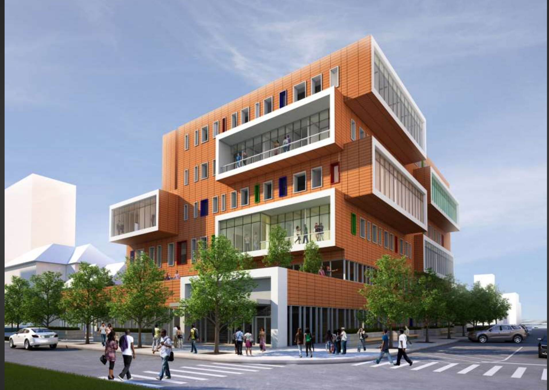
University of Illinois at Urbana Champaign Cultural, Ethnic, & Gender/Women's Studies Building | Moody Nolan, Inc.