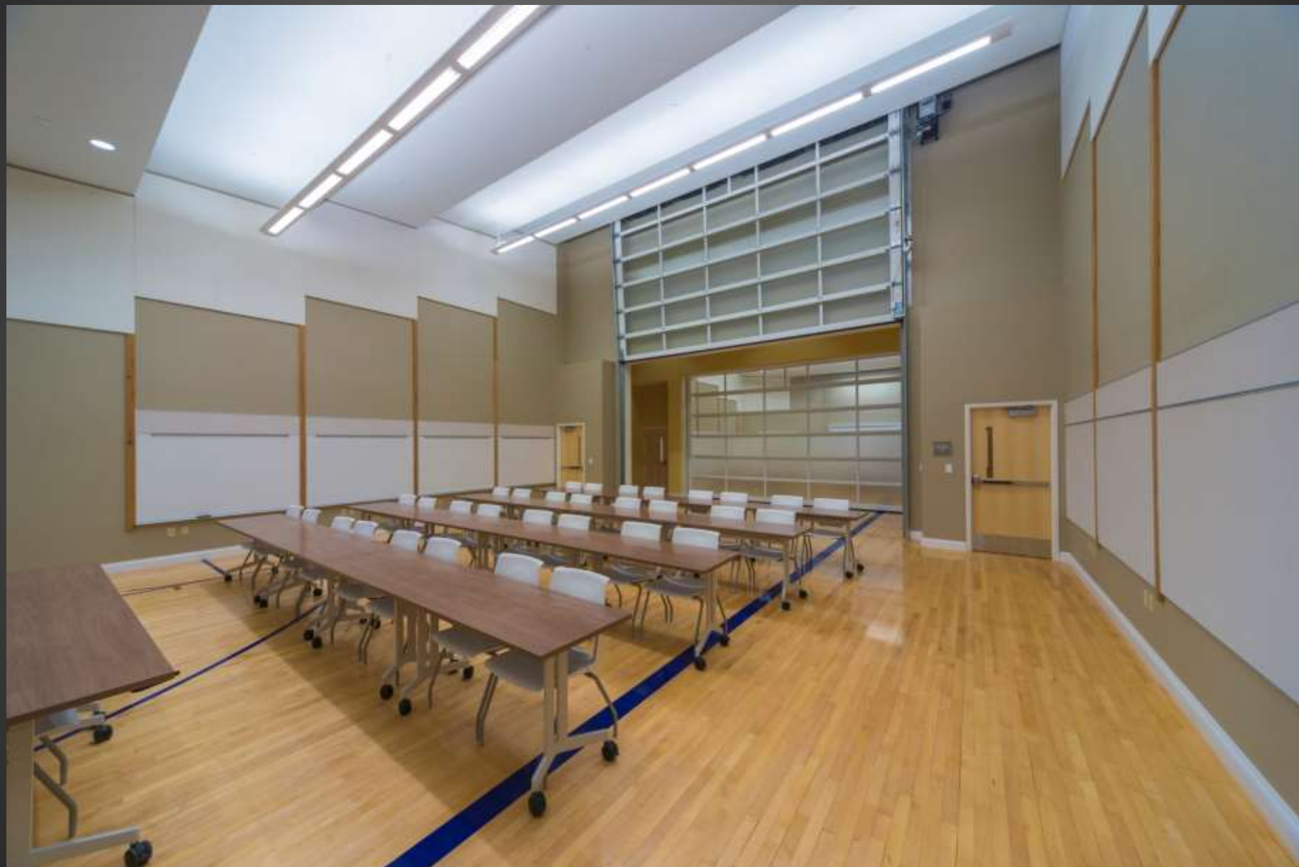
Hanover College, Lynn Hall Renovation | SPGB Architects