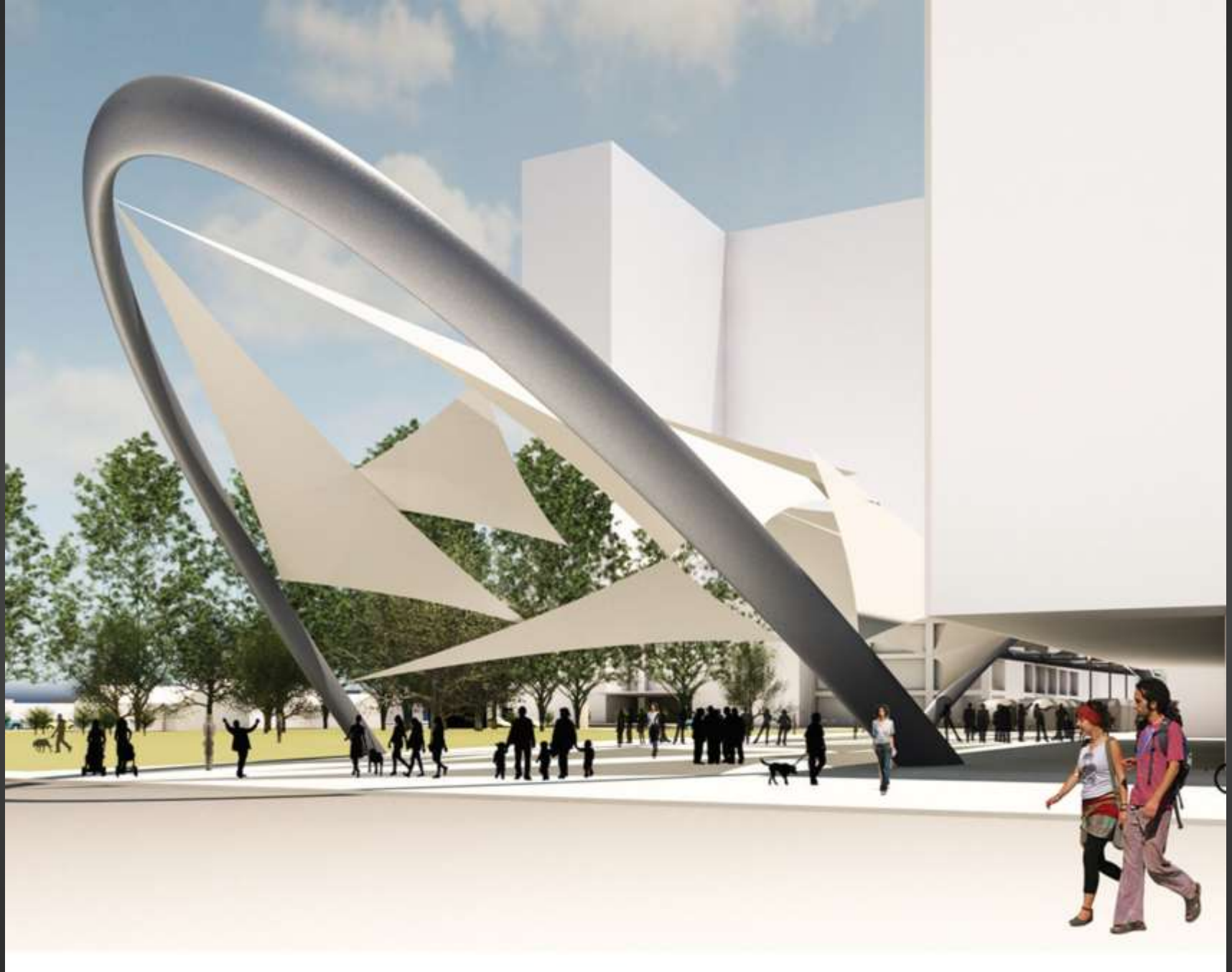
Austin Transit Center | AECOM Technical Services, Inc.