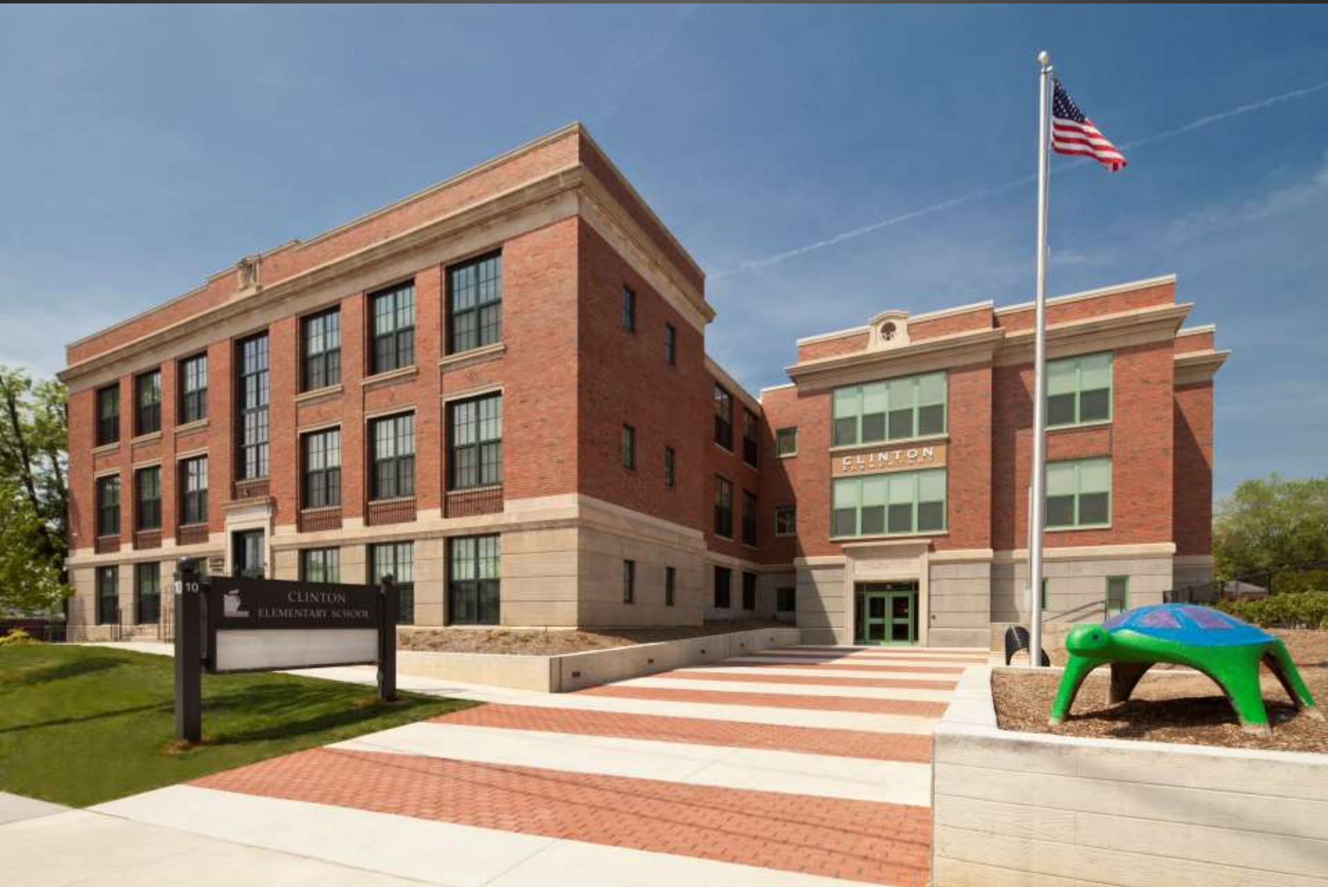
Clinton Elementary School | Schooley Caldwell Associates