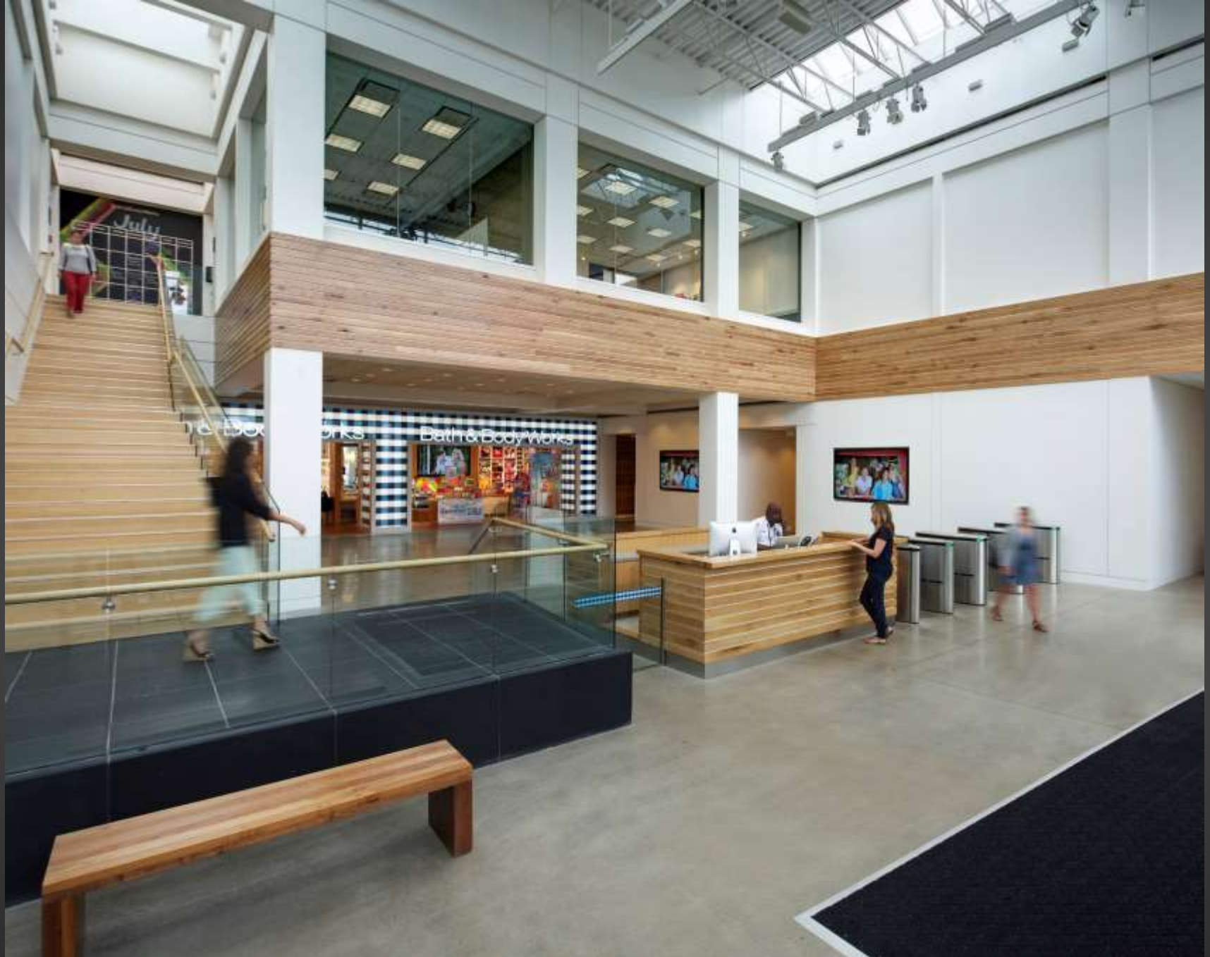
L Brands Interior Renovation | Meyers + Associates Architects