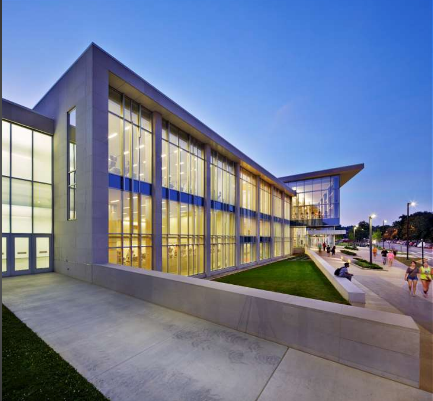
Purdue University France. Cordova Recreational Sports Center | Moody Nolan, Inc.