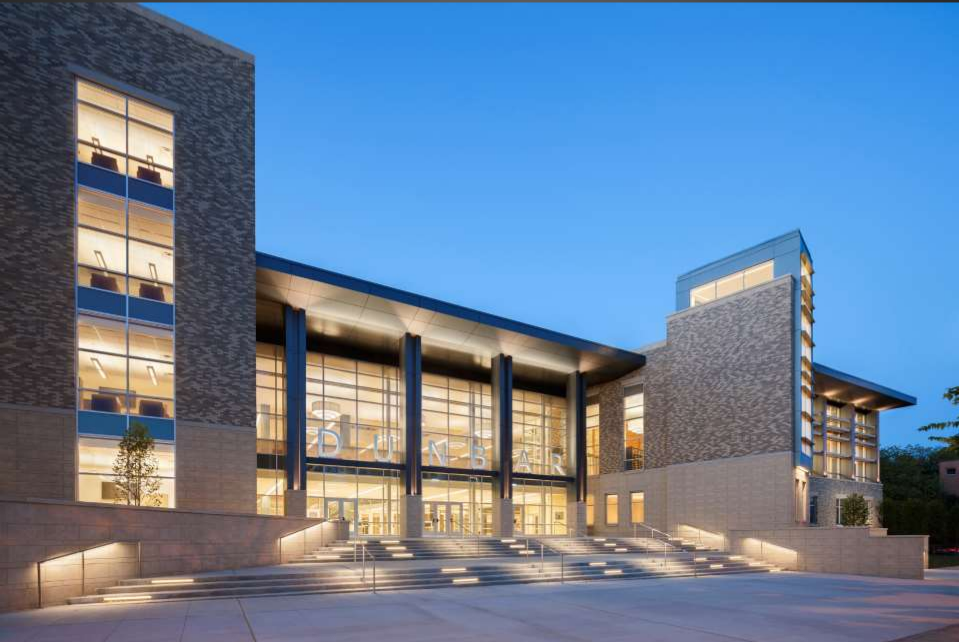
DC Dept. of General Services Paul Laurence Dunbar Senior High School | Moody Nolan, Inc.