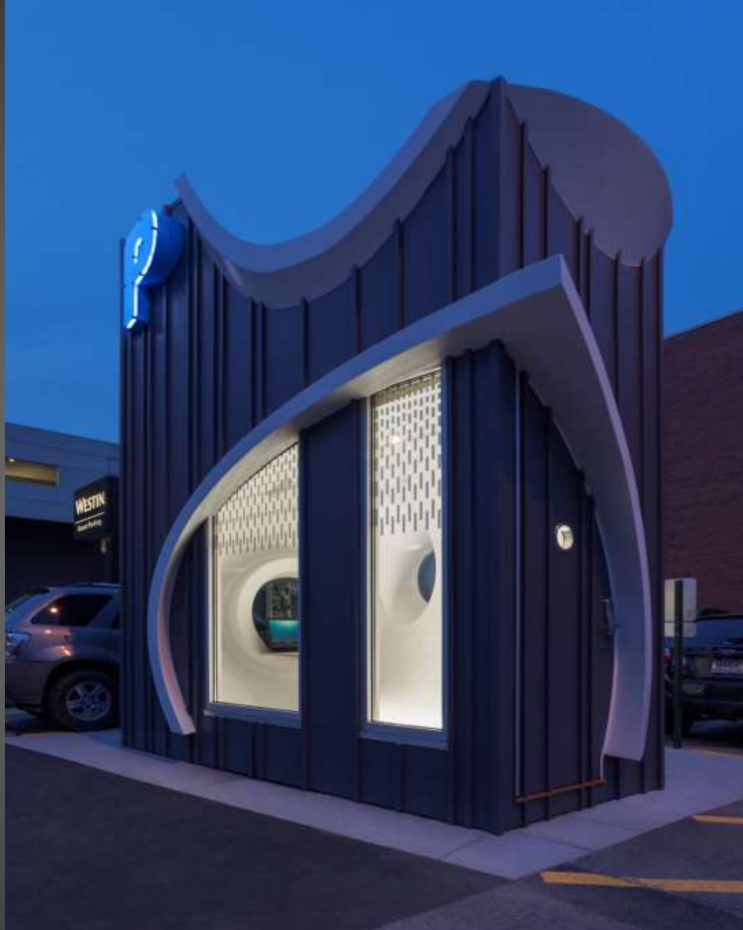
Coney Island | Blostein/Overly Architects