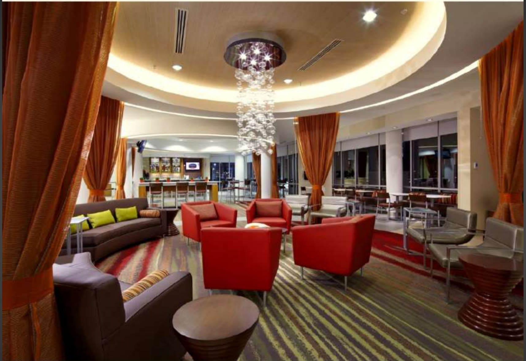
Springhill Suites Columbus | Meyers + Associates Architecture