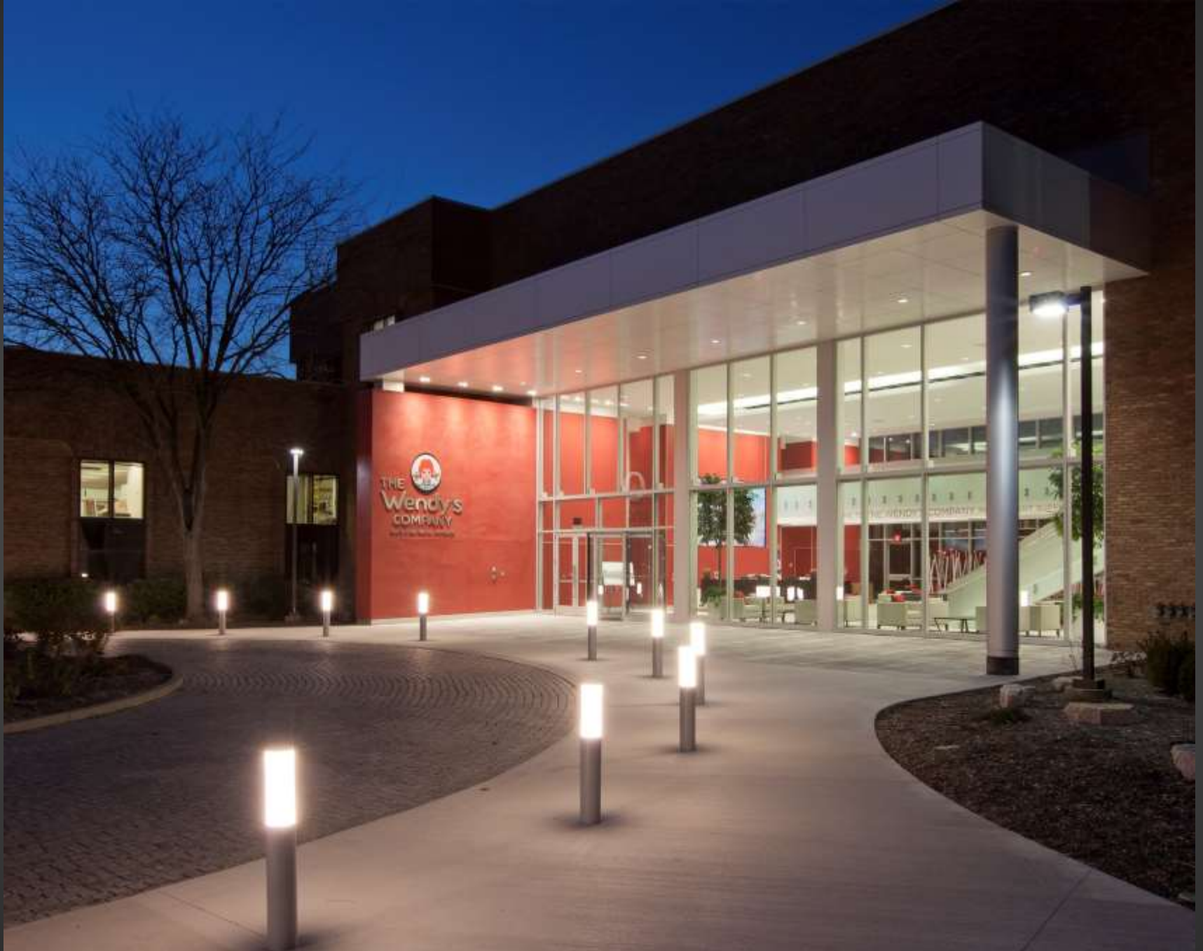
Wendy's Headquarters | BHDP Architecture