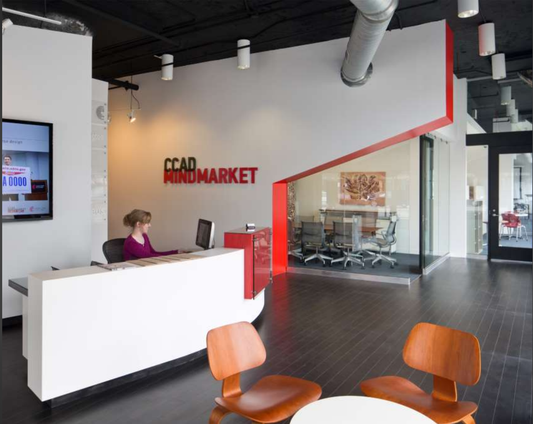
CCAD MindMarket | Acock Associates Architects