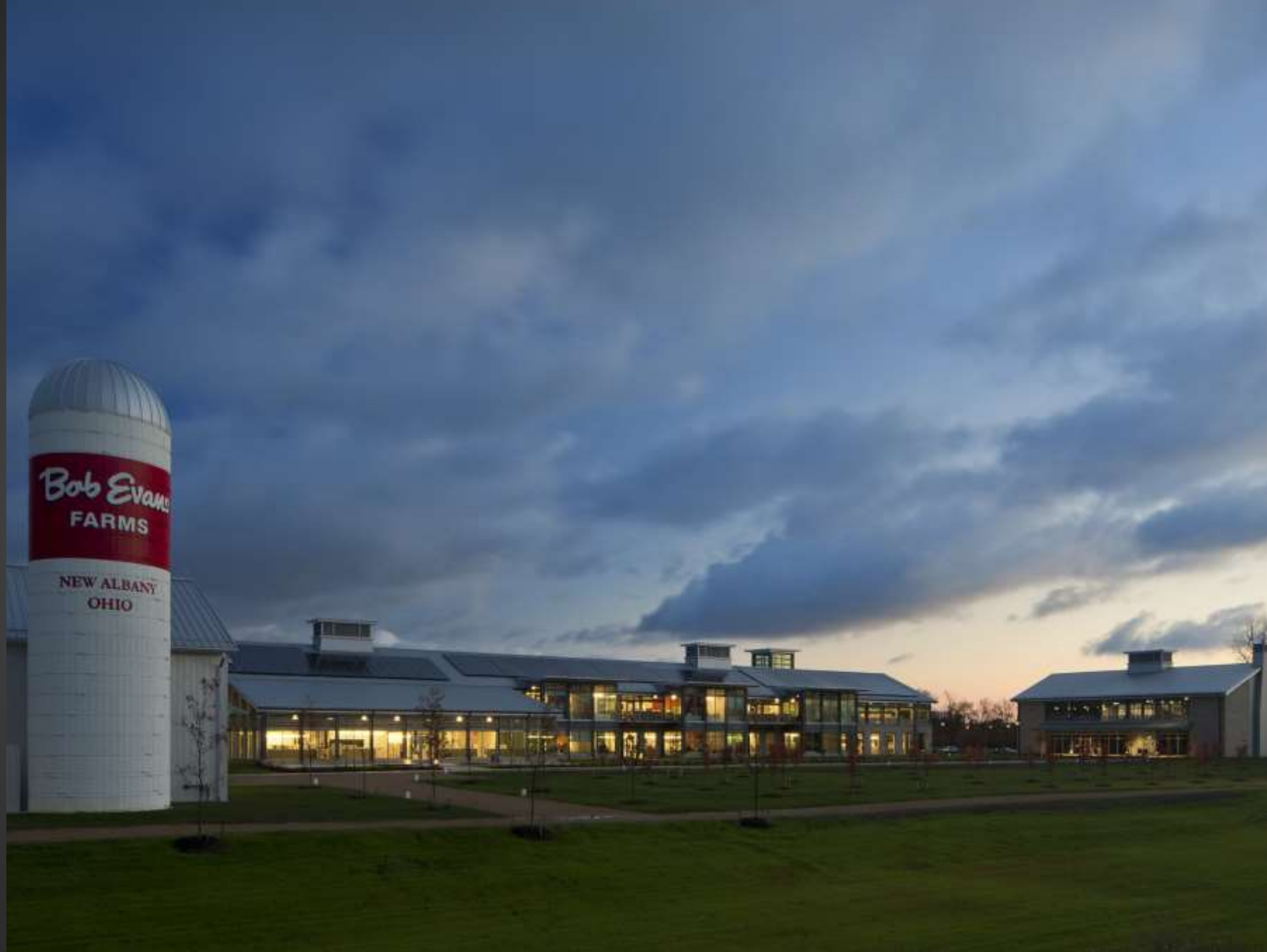
Bob Evans Farms Corporate Headquarters | M+A Architects