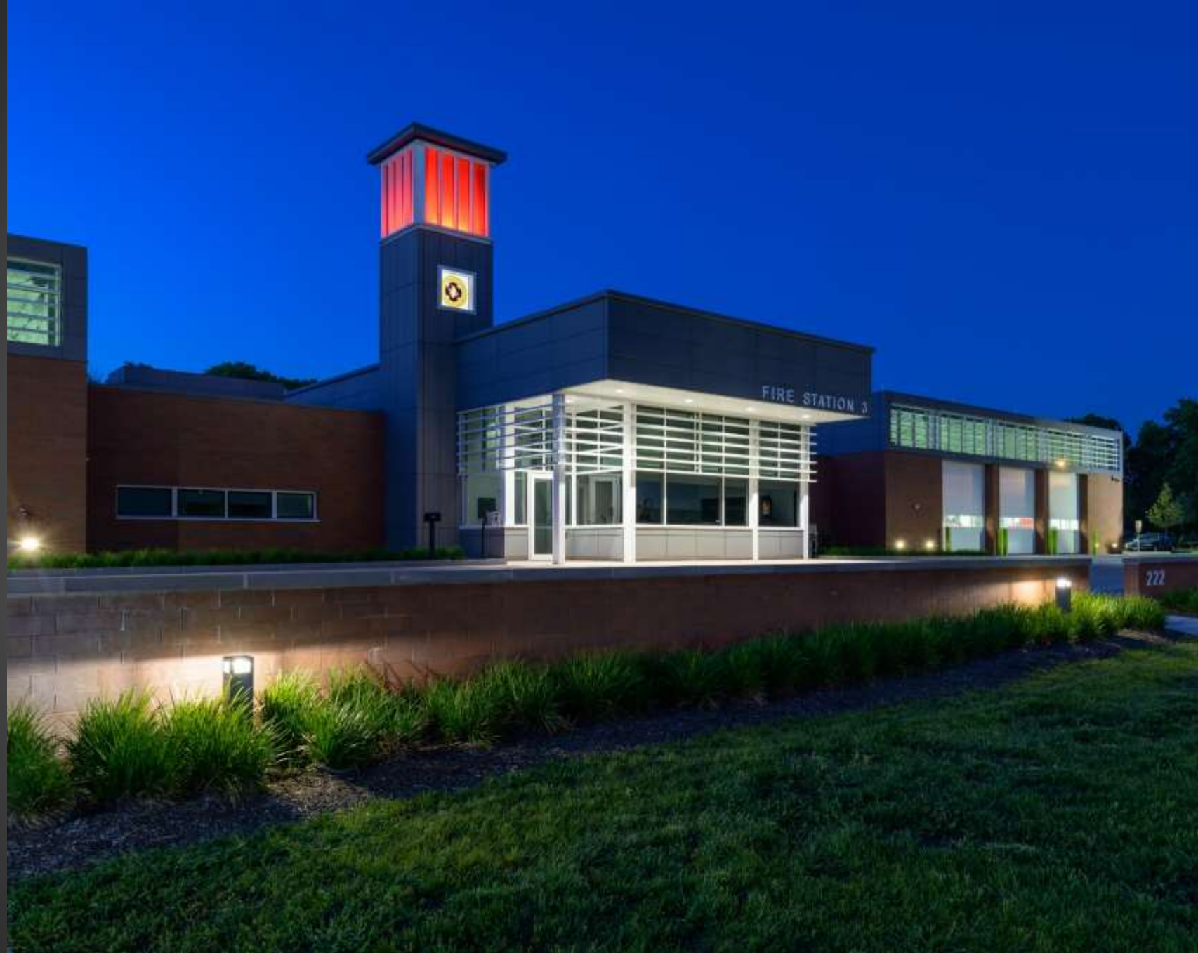
City of Columbus Mitchell J. Brown Fire Station No. 3 | M+A Architects