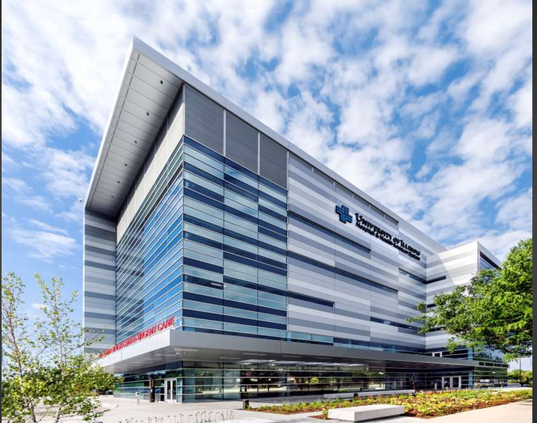
University of Illinois Hospital and Health Sciences System Mile Square Health Center | Moody Nolan, Inc.